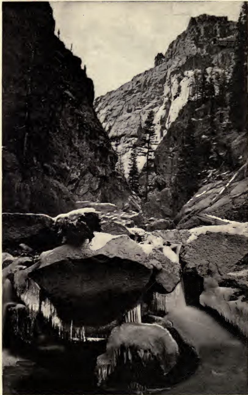
LOS PINOS CANON TOLTEC GORGE SHOWING TRAIN OF CARS ENTERING TUNNEL